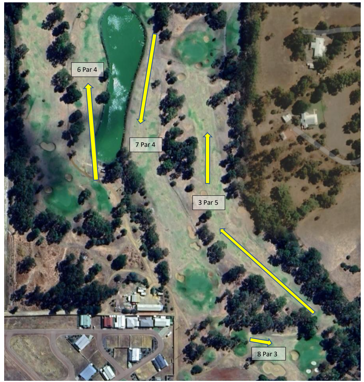
Hole 3 and some return holes 6, 7 & 8