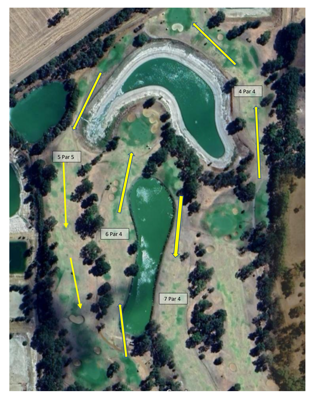
Hole 4 par 4 (318 Metres) Index 15 A short hole with a dogleg left, tee shot is the key here, you may be tempted to go for the green and is reachable but there is out of bounds over the back and carrying the water gets difficult if you stray left. A straight iron shot down the centre is a better way to go as the green is not hard to hit from most places on the fairway.

Hole 5 par 5 (444 Metres) Index 12 The best chance for a birdie, a long tee shot keeping to the left should bring you well within range. A slightly raised large green is protected at the front left and right by bunkers, the green has some subtle roles.