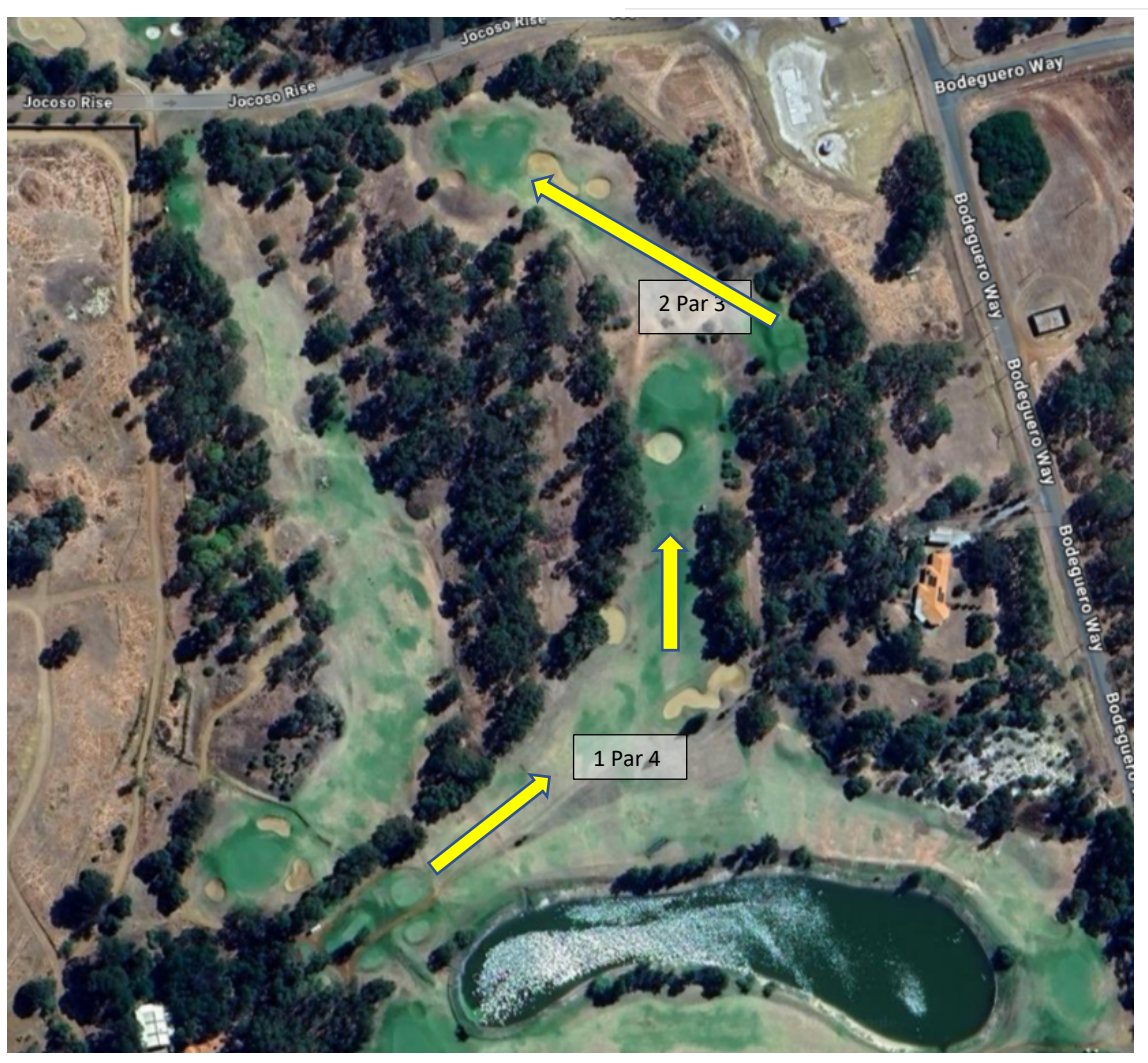
Hole 1 Par 4 (318 metres) Index 12 An uphill fairway and a raised green makes this hole play longer than it looks on paper. A long tee shot on the right may see you run out of fairway, a tee shot cutting the dogleg left corner missing the bunker is the best shot here. Green is sloped to the front right, and is guarded by a large bunker at the front. Best to hit a short iron in if possible.

Hole 2 Par 3 (161 Metres) Index 9 Once again a tee shot uphill to a green protected by a large bunker at the front, take plenty of club as mounds at the back right of the green will stop you going too long. A long shot to the left may find a hidden bunker at the left rear.